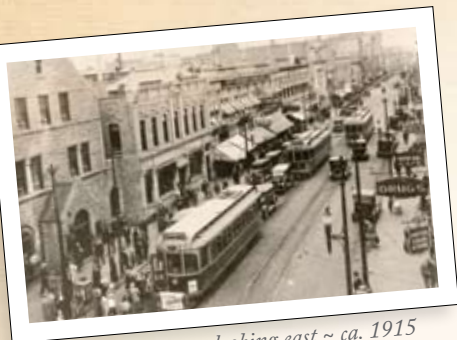
Stephen Avenue looking east ~ ca. 1915